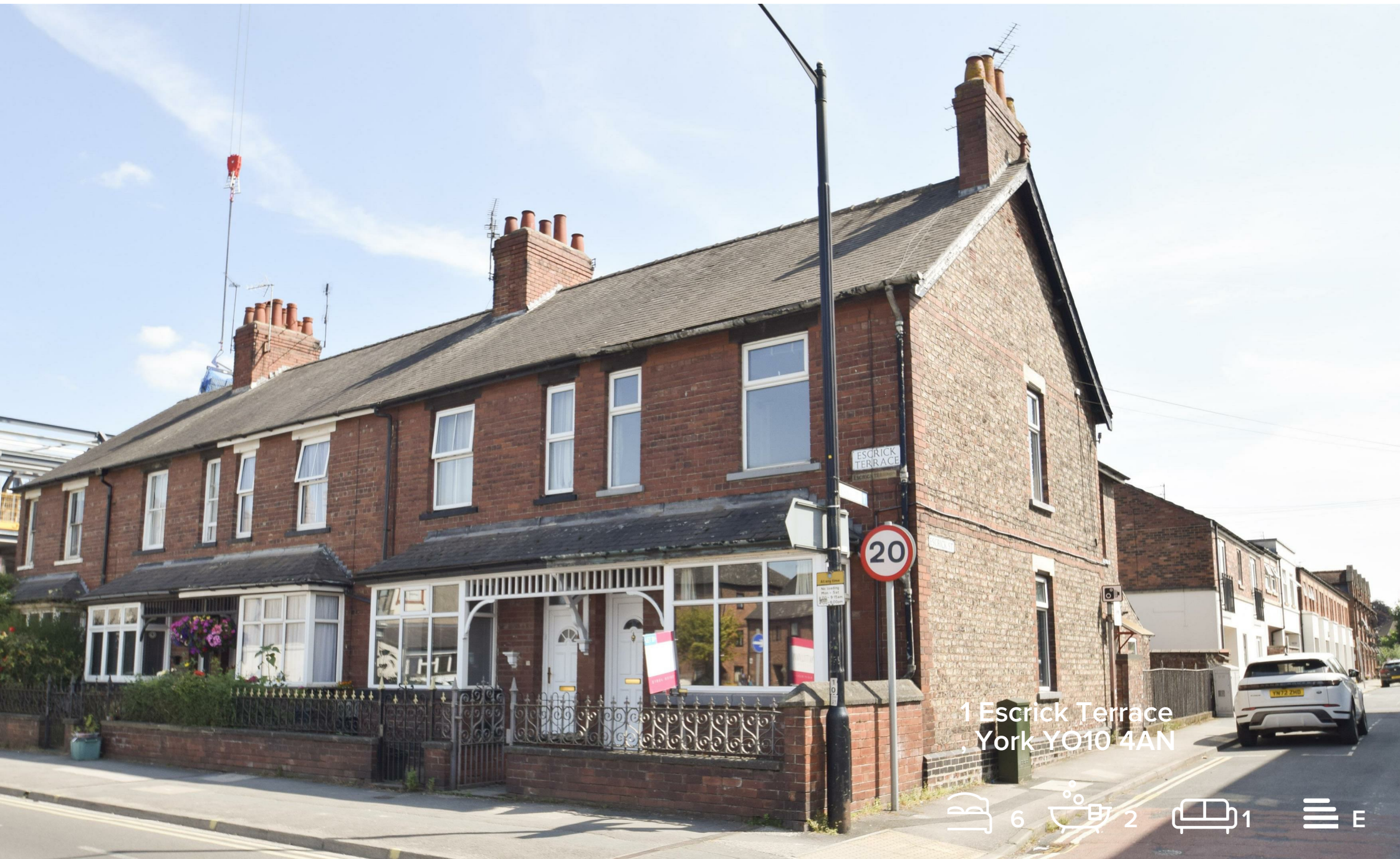
1 Escrick Terrace York YO10 4AN